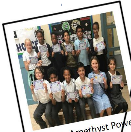
Amazing Amethyst Power!