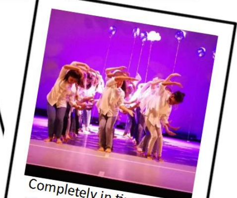
Completely in time - great amethyst and grit power!