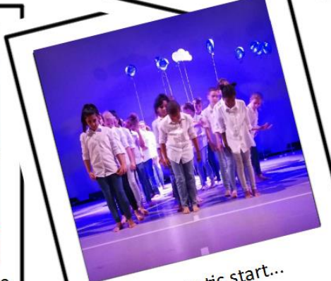
A dramatic start...