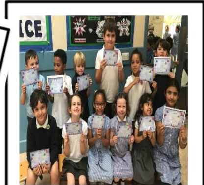
Amethyst Power winners!