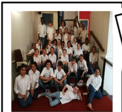
Y5/6 stages Gala performance - before...